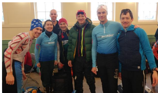
Part of the 2nd place team YEG Nordic