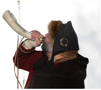
A Call for Board and Loppet Members

Did you get your Finisher Medallion for completing