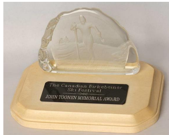
John Toonen Award