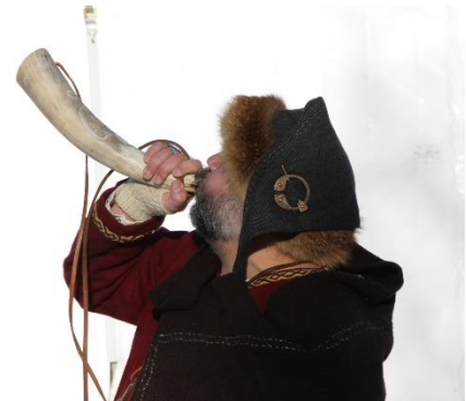
A Call for Board Members

The Director is responsible for the development and implementation of a comprehensive marketing and media plan. This an exciting opportunity for a sports enthusiast!