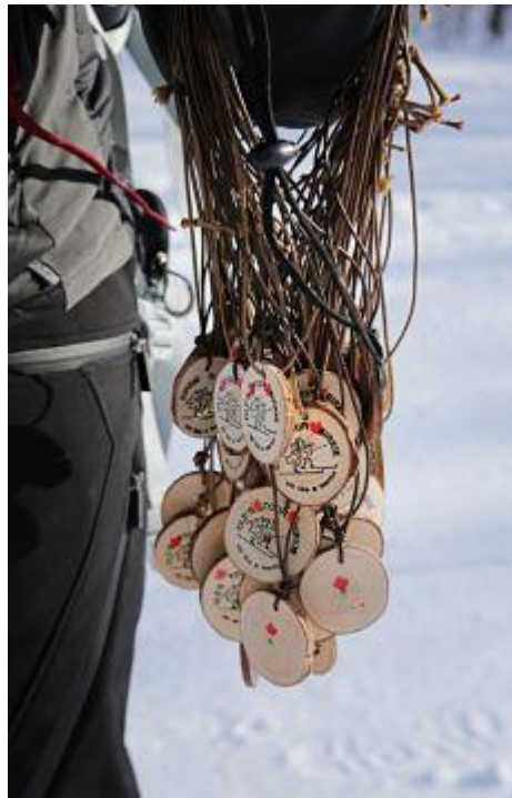
Wooden Birkie Medallions