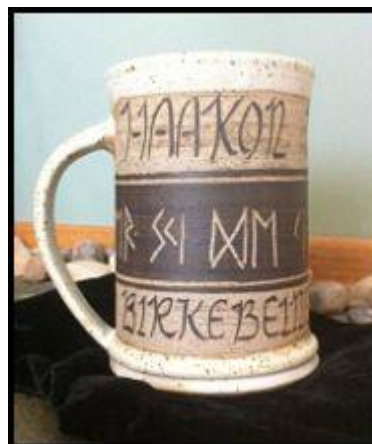
Haakon Haakonsson Mug